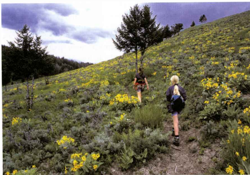
Diverse rangelands provide increasingly popular opportunities for outdoor recreation; photo courtesy National Park Service.

Despite the importance of this unique resource, trends in ecological, economic, and social components of rangeland sustainability currently are not consistently monitored or reported (1). Absence of such critical information makes it difficult for stakeholders to communicate about rangeland issues with each other, the general public, media, and policymakers (3).