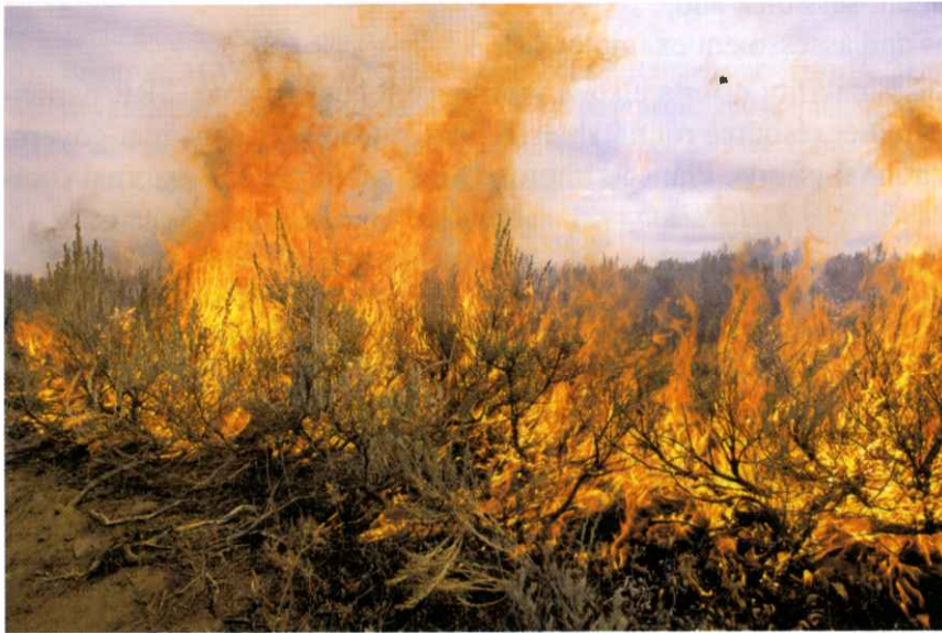
Disturbances including erosion, fire, and establishment of invasive plant populations impact rangeland sustainability; photo courtesy USDA Agricultural Research Service.

Currently some fire information is available, while protocols for additional data sets must be developed. Limited data exist on acres burned at regional and national levels, but data collection methods and procedures are not standardized. Also, data about fire location and seasonality are largely unavailable (3).