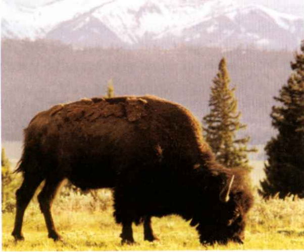
Grazing land use for wildlife habitat and wildlife-related human activities is projected to increase over the next 50 years

Maintenance of productive capacity implies that future generations also will be able to obtain their desired mix of market and non-market goods from rangelands. Identifying and monitoring production of goods and services over long time frames requires multi-scale measurement capability, spanning the ecological site to the eco-region. These spatial and temporal scale issues provide additional challenges for SRR and land managers in general.