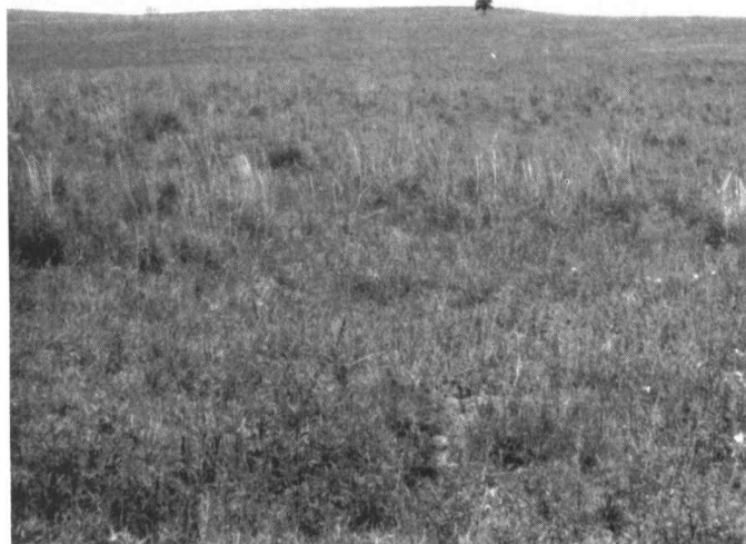
J.D. Blaylock's homestead re-established to native grasses.

In 1948, the Red River was dammed below the mouth of its tributary Washita River to form Lake Texhoma. (Red River is the boundary between southern Oklahoma and northern Texas.) The first year after the Lake's outlet gates were closed, the silt in the mouth of the Washita was 17 times the estimated annual siltation.