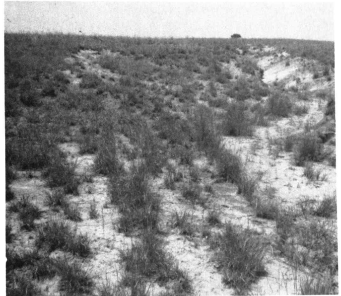
Severely eroded land is hard to establish to native grasses.

Before April 19, 1892, part of the Cheyenne-Arapaho country, Indian Territory, was leased by white men for grazing of livestock. But on that date the area was opened for land