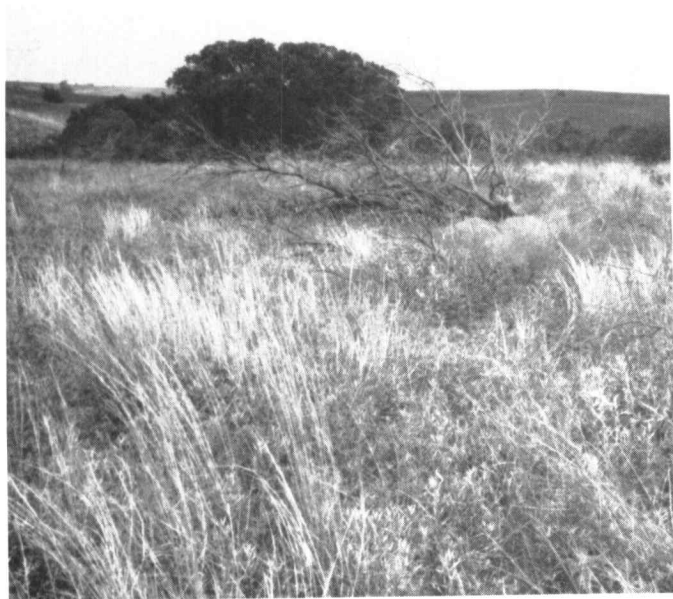
Elms and juniper and annual grasses will invade disturbed lands in western Oklahoma.

Eventually, many once promising ranches and farms were abandoned. In western Oklahoma this meant the invasion of weeds, annual grasses, elms, and juniper trees into the overgrazed and disturbed grasslands.