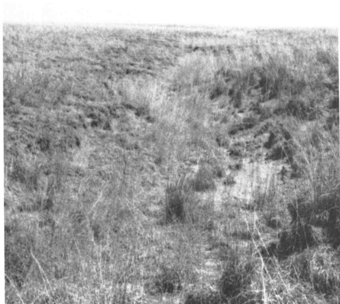
Grass trying to heal a gully.

be "fruitful in all sorts of products" was to undergo changes such as neither he nor these early settlers could have foreseen.