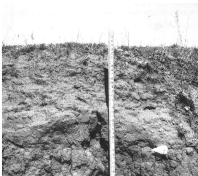
Grass boundary on outleft of a 30-acre disturbed area catches 2 1/2 feet of silt before gully erosion started.

land. Before and during World War I, he was encouraged to turn over grass sod and grow more corn for the cause. My grandfather's Cheyenne neighbors, the Standing Waters, Scabbies, and White Shields watched and helped harvest the crops. Production was poor to fair, but resulting soil erosion must have been incredible!