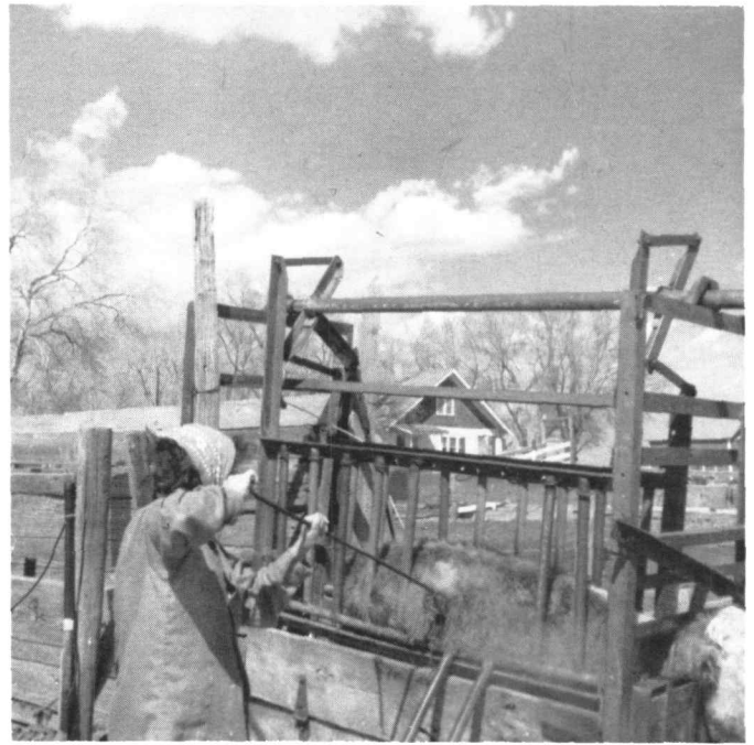
The author branding cattle.

I heartily recommend that other ranch wives keep similar records of their contributions. Of even greater importance, participate in the operations at least to the extent of knowing the state of the business.