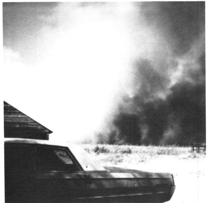
The prairie fire that caused the death of Wilber Frasier.

There were the usual unexpected minor crises —one day I noticed a heifer with two complete loops of wire drawn tightly around its ankle, cutting into the flesh to the bone. I