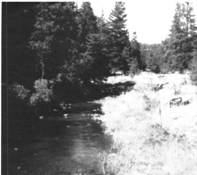
In Oregon separate fencing and delay of grazing until late summer has been beneficial in terms of vegetation, livestock and wildlife on riparian zones in mountainous areas.