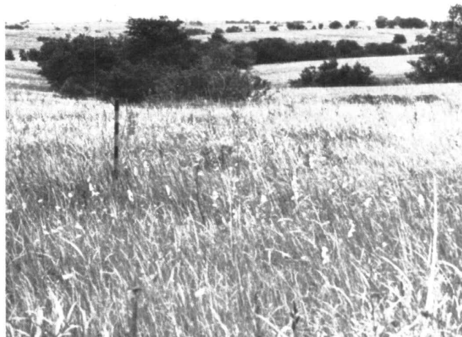
The Merrill three-herd/four-pasture system has proven superior to continuous grazing in terms of vegetation, livestock performance, and wildlife on Texas rangelands where effective precipitation can occur at any time during the year.

In the early 1950's Leo B. Merrill in south central Texas developed a grazing system involving three herds and four pastures. With this system each pasture is grazed continuously for a year, and then given a four-month period of nonuse. The period of nonuse in each pasture has occurred during all times of the year at the end of a four-year cycle.