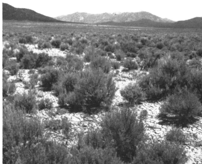
Big sagebrush ranges with little remaining understory have shown little response to any grazing system including complete livestock exclusion. Control of big sagebrush will be necessary before any improvement in productivity of the above range will occur.

esthetics, and forage productivity. Many managers and researchers have concluded that the only means of restoring and maintaining these valuable areas is complete livestock exclusion. However, this alternative is unacceptable to ranchers. Recent studies have shown improvement of riparian zones may be possible without complete livestock exclusion.