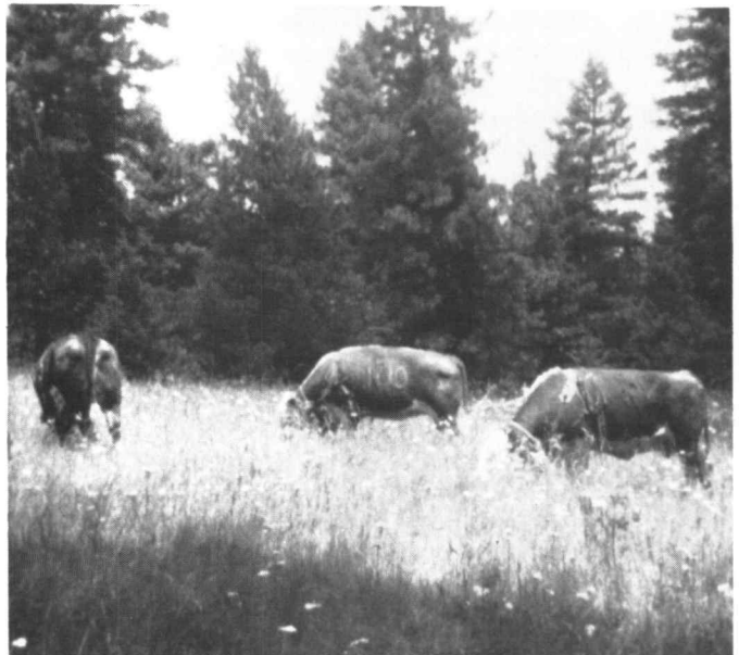
Deferred rotation grazing has improved the condition of mountain ranges in the northwestern United States without reducing livestock performance when compared to season-long grazing.

Deferment involves delay of grazing until seed maturity of the important forage species is completed. Rotation is the movement of livestock from one pasture to another on a scheduled basis. Initial research on this system was conducted by Arthur Sampson in the Blue Mountains of north-eastern Oregon in the early 1900's. The system he studied involved dividing the range into two pastures. Each pasture received deferred grazing every other year. Vegetation response under this system has been superior to continuous