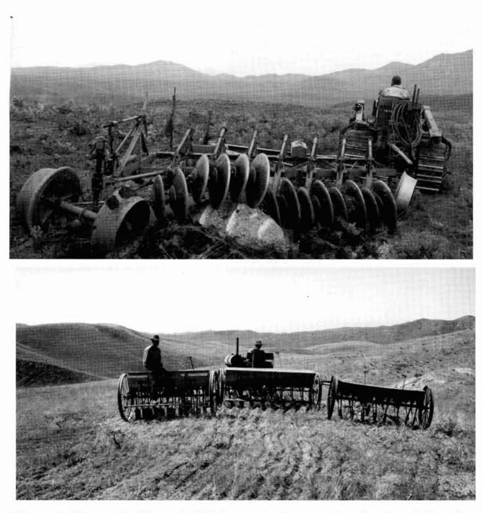
Figure 4. Thousands of degraded Utah rangelands were plowed and seeded to plant materials, as occurred at the Benmore Experiment Station.

Some of the early plant materials used in Utah that were released from PMCs include; 'Manchar' smooth brome–1943, 'Sherman' big bluegrass–1945, 'Greenar' intermediate wheatgrass–1945, 'Primar' slender wheatgrass–1946, 'Bromar' mountain brome–1946, 'Whitmar' bluebunch wheatgrass–1946, 'Ioreed' reed canarygrass–1946, 'Alkar' tall wheatgrass–1951, 'Topar' pubescent wheatgrass –1953, 'P-27' Siberian wheatgrass–1953, 'Nordan' crested wheatgrass–1953, and 'Sodar' streambank wheatgrass–1954.