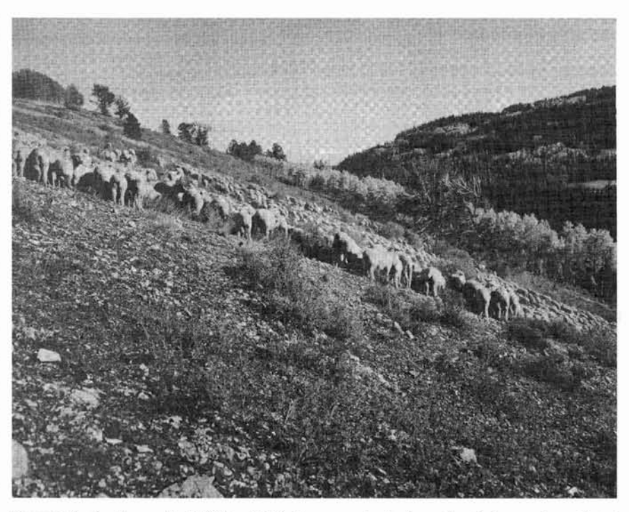
Figure 2. In the early 1900's, A.W. Sampson had sheep herded over broadcast seedings at the Great Basin Experiment Station, near Ephraim, UT.

However, A. W. Sampson, who some consider the father of range management, established plots of various plant species at the Forest Service Great Basin Experiment Station in 1912 and 1913. During the autumn of 1912, he planted timothy, Kentucky bluegrass, orchardgrass, white sweetclover and red clover. In some cases sheep were herded over the seeded areas to trample in the seed (Fig. 2). In 1913, three thousand six hundred plant cuttings and sprouts of aspen, willow, mountain elder, and "other