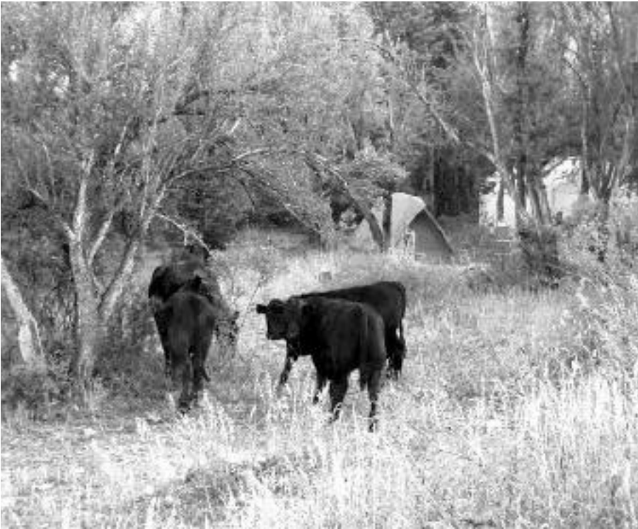
Campground, Great Basin National Park.

grandfathered livestock grazing in Death Valley National Park, 5 a provision in the Draft Environmental Impact Statement/General Management Plan for the park would retire grazing permits in the same manner as was done in Great Basin National Park. 6 The Park Service is using its general management authority to allow for permit retirement. The revised DEIS/Plan will be finalized in 2001.