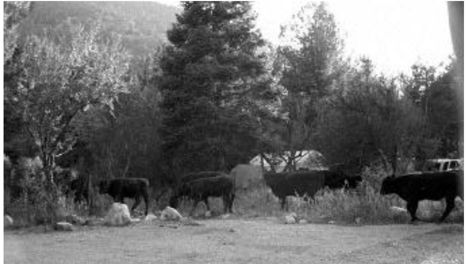
Campground, Great Basin National Park.

Owyhee Canyonlands, Idaho • In 1998 the U.S. Air Force sought to create a bombing range in the Juniper Draw on the East Fork of the Bruneau River in southeastern Idaho. One grazing permit had to be retired before the area could be used for training. Legislation sponsored by then-Senator Dirk Kempthorne (R-ID) authorized the Air Force to "buy out" the permit. 4 In addition, the Air Force was directed to purchase replacement AUMs on an adjacent allotment from another rancher and transfer those to the displaced permittee as additional compensation for his loss. The displaced Juniper Draw permittee was compen-