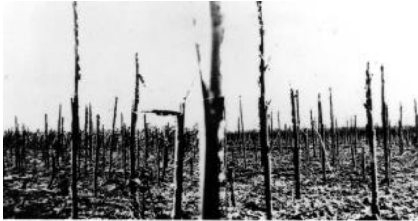
Grasshopper infestation in South Dakota.

If progress is to be made in the study of grasshopper population dynamics, a new paradigm must be adopted. To date, research on grasshoppers has been structured by the traditional, hierarchical levels of biological organization: organism, population, community, ecosystem,