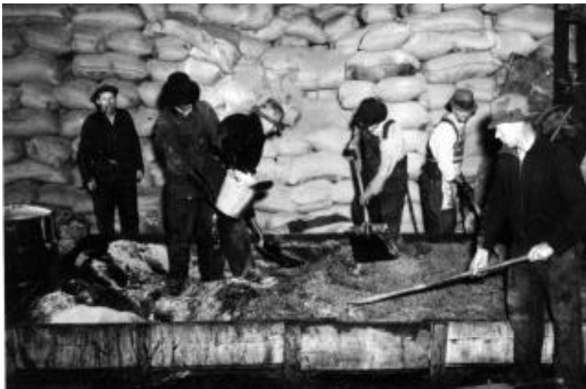
Mixing grasshopper bait, 1941.

Interest in predicting grasshopper population levels and preparing for outbreaks, dates to the earliest days of grasshopper research. The second report of the U.S. Entomological Commission (USEC 1880) proposed the establishment of “a permanent system of [locust] observations and warnings” and daily bulletins to publish information on swarms. In the third report, the forecast for the coming summer was based on the “widely scattered” infestations of the previous year (USEC 1883). A similar approach has been used since the 1930's: Grasshopper surveys are taken annually for many western states and hazard maps are drawn, based on the field observations, to estimate grasshopper densities for the coming season.