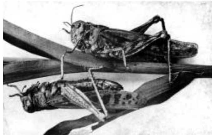
Rocky Mountain locusts.