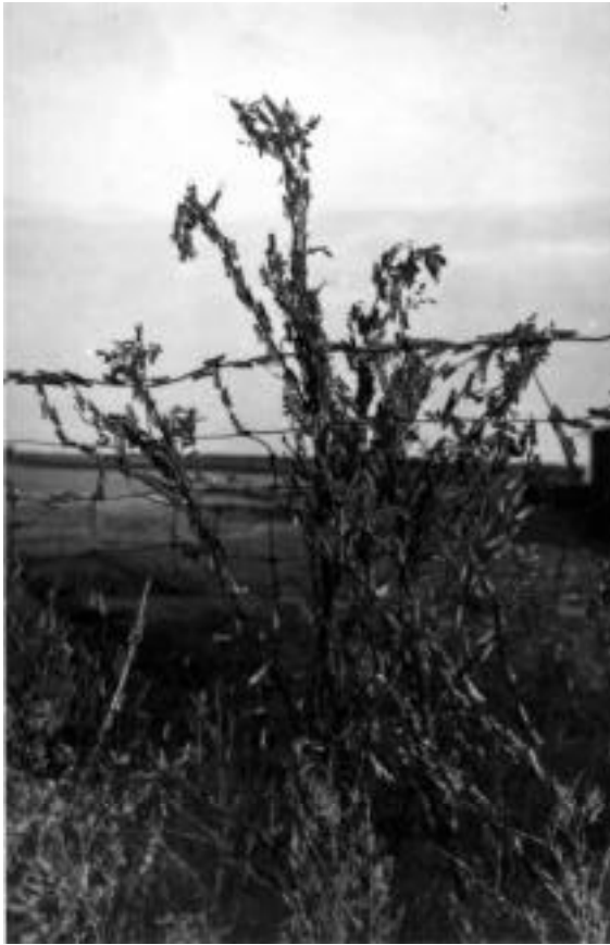
Grasshoppers waiting for the temperature to rise at Marshall, Minnesota.

In the late 1980's, new techniques and computing power helped fortify efforts to predict and prepare for high grasshopper numbers. A computer simulation model called HOPPER was developed to improve decision-making when selecting between grasshopper treatment options. Research also was conducted on grasshopper community ecology and competition.