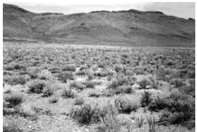
Fig. 2. A winterfat plant community under long term moderate grazing on the Desert Experimental Range in southwestern Utah.