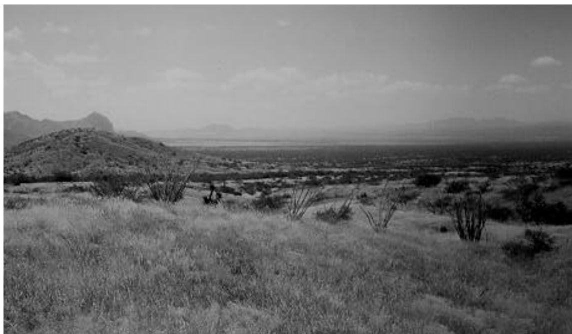
Fig. 3. A long term moderately grazed pasture on the Santa Rita Experimental Range in southcentral Arizona.

The primary study evaluating grazing management on the Santa Rita Range involved 2 blocks with 3 pastures that were assigned to year-long, summer-fall, or winter-spring grazing by cow-calf herds. Over the 10 year study period (1957 - 1967), Martin and Cable reported that perennial grass cover and yield showed a strong decreasing relationship to increasing forage use. At the same time burroweed, an undesirable species, was positively associated with increasing forage use. Year-long pastures received lower forage use than those grazed seasonally. They, in turn, had higher perennial grass cover. Herbage yields on year-long pastures showed more increase than on seasonally grazed pastures. The authors concluded the consistency with which higher perennial grass