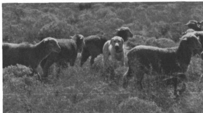
Princess with Rambouillet sheep on the Jornada Experimental range. Socialization of sheep to dog and cohabitation is critical to the protection of sheep from coyote predation.

(Flock A). This (socialization) was done so that the sheep would learn to tolerate the close association of the dog and not scatter. After 6 days the sheep were divided into 2 groups