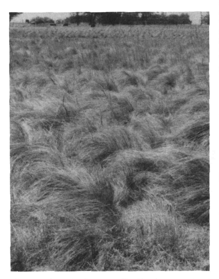
Unmanaged weeping lovegrass with old mature stems is not forage.

tore vigor to the native grasses. Winter or dormant season grazing is acceptable and should be encouraged especially in the higher precipitation areas of central and eastern Oklahoma to prevent excessive accumulations of mulch. Plant succession can be enhanced with judicial use of herbicides and controlled burning. However, the most important ingredient in range improvement is to provide the native grass a chance to grow during the growing season to enhance vigor and density. An obvious complementary role of the introduced grass pasture is to provide forage while the range is being deferred.