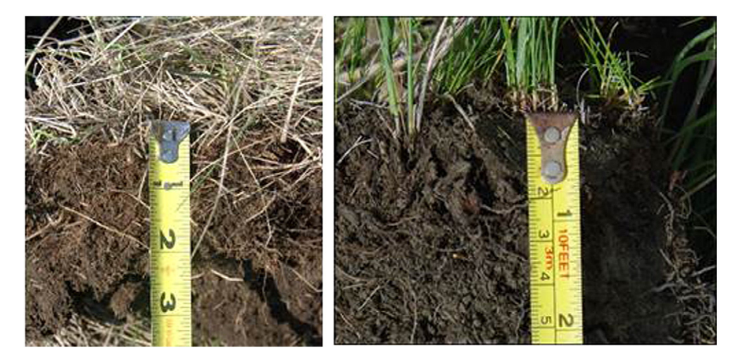
Figure 3. (A) Soil profile from invaded state plant community showing approximately 2 inches of Kentucky bluegrass root mat and thatch layer. (B) Reference condition profile with no Kentucky bluegrass root mat or thatch layer.

timing, and intensity of fire events may need to be reconsidered. Past application of fire as a single, infrequent disturbance generally has been ineffective in changing the nitrogen feedback mechanism to favor native grasses. Therefore, burning frequency and intensity may need to be increased and carefully timed and coupled with other disturbance events such as properly managed grazing to change the plant community composition.