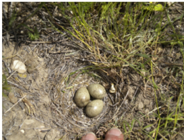
Figure 4. Bird communities adapt to changing landscapes as grass and shrub densities change (Horned lark nest, 29 May 2009, Park Valley UT).

Richness and diversity in the bird community are also affected by conversion of sagebrush to grassland. In addition to the tendency of grasslands to favor a different avian assemblage than sagebrush, the structure and heterogeneity of patches has been shown to affect species assemblages. 17 Researchers in Nevada found that the highest species diversity was found not in undisturbed sagebrush stands, but in crested wheatgrass seedings that had been invaded by sagebrush. Unlike the more