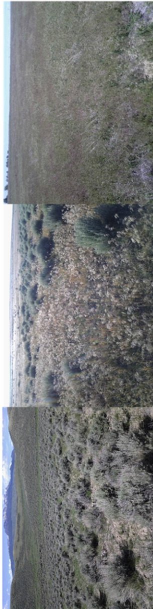
Figure 1. Healthy big sagebrush dominated rangeland (left), sagebrush invaded by cheatgrass (center), and cheatgrass dominated rangeland formerly dominated by sagebrush (right).

Although fire is a natural part of the sagebrush steppe system, invasion of annual grasses has resulted in increased fire frequency in some areas where natural successional processes have not occurred after fire. 7 During natural succession, plants generally resprout from the available seedbank or from seeds that disperse into the disturbed area from nearby unburned patches. Where cheatgrass ( Bromus tectorum ) has invaded, it is likely to become more common in the seedbank as the diversity of native grass, shrub, and forb species decreases (Fig. 1). 7