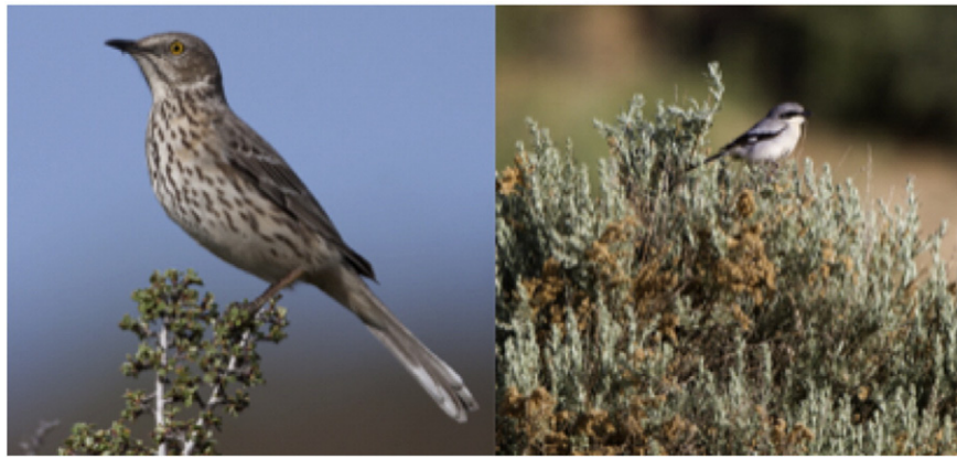
Figure 3. The sage thrasher (left) is considered a sagebrush obligate, while the loggerhead shrike (right) is associated with sagebrush and grasslands.

cheatgrass understory. In areas where smooth brome ( B. inermis ) has invaded, the understory is generally more dense, which may confer a benefit to species nesting in these areas. 20 Compared with areas with an understory comprised mainly of native grasses, Brewer's sparrow nest establishment in areas with a smooth brome understory occurred later and fewer eggs were laid, but overall nest success, as measured by hatched and fledged young, was higher. 20 Earnst and Holmes also reported that predation of nests and fledglings was lower in non-native grass-dominated areas, probably as a result of taller grasses comprising the understory as well as higher overall coverage within the understory. 19