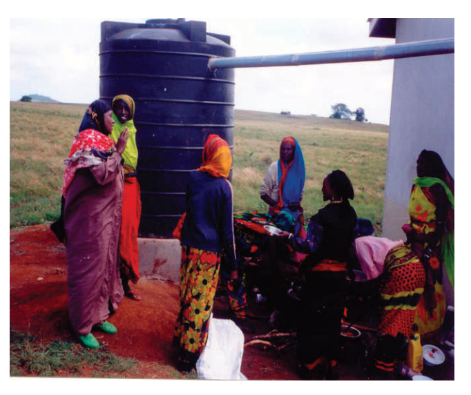
Figure 2. Kenyan woman showing Ethiopian women a new water storage system funded and implemented by a Kenyan women's group. This event took place during a tour of northern Kenya by pastoral women leaders from southern Ethiopia.

In contrast to the members of women's groups in northern Kenya, pastoral women in southern Ethiopia tended to be more traditional in terms of how they dressed and acted. The Ethiopians also appeared haggard compared to the Kenyans. Both the Ethiopians and Kenyans were from the Boran tribe and shared a language and cultural heritage. The Ethiopian Boran typically lived in scattered encampments rather than the permanent settlements that characterized the Kenyan situation. Daily life for married Ethiopian women was often