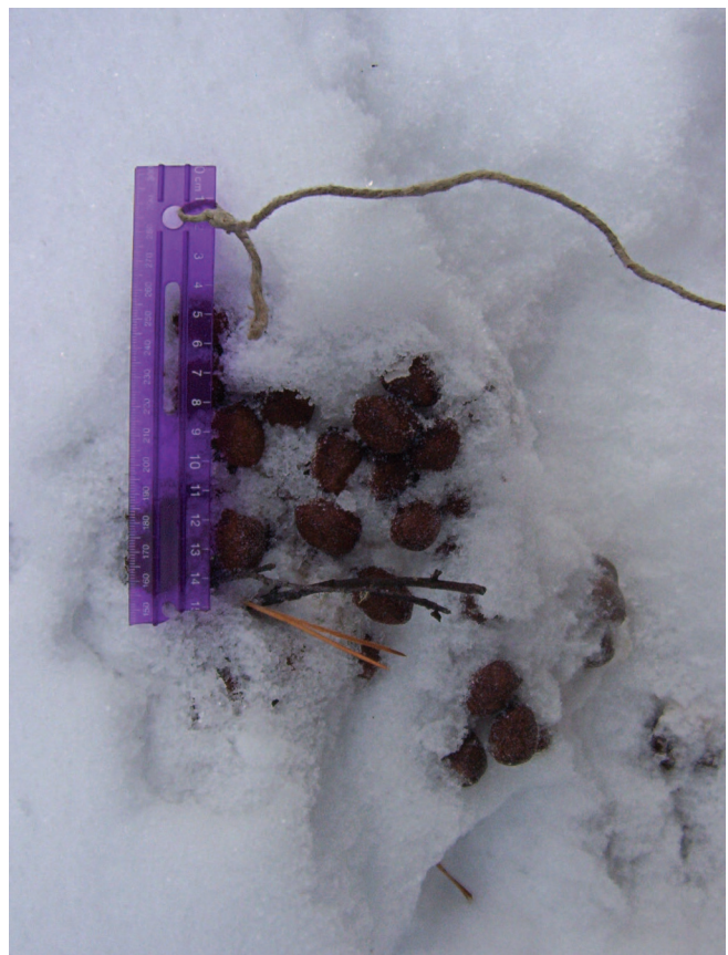
Photo 3. A fecal sample used to make composite diet samples of elk populations.

or from the field on open prairie flats (Photo 3) from February to June (Table 1). Each sample constituted a composite of two individual pellets selected from 20 pellet groups; this was a sample size of composite samples similar to a previous study, which examined the comparative diet content of ungulates. 12 Pellet groups were located \leq 100 m from vegetation plots and were separated by >1 m to provide a representation of population diet. We separated samples seasonally into winter