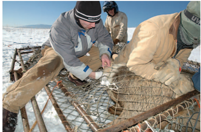
Photo 2. Collection of fecal samples during handling of adult cow elk.

or from the field on open prairie flats (Photo 3) from February to June (Table 1). Each sample constituted a composite of two individual pellets selected from 20 pellet groups; this was a sample size of composite samples similar to a previous study, which examined the comparative diet content of ungulates. 12 Pellet groups were located \leq 100 m from vegetation plots and were separated by >1 m to provide a representation of population diet. We separated samples seasonally into winter