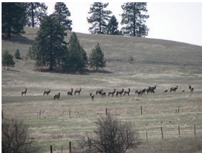
Photo 1. Rocky Mountain elk populations were located in ponderosa pine–mixed bunchgrass communities with varying levels of invasive species.

We collected pellet samples from elk rectums during the handling of 12 adult females for a related study (Photo 2)