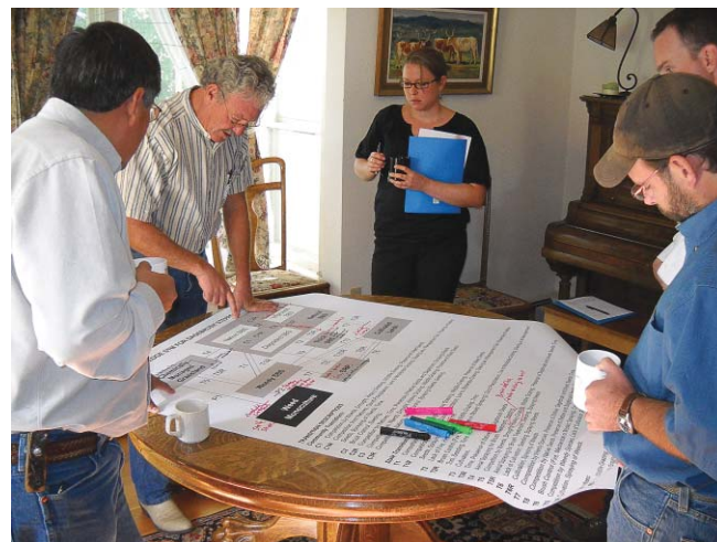
Figure 1. A group evaluating a state-and-transition model at a workshop.

Focus groups are small groups of 6–15 people who are invited to have an informal, semistructured conversation about a subject of interest. It is best to hold separate focus groups for different types of participants with similar backgrounds (e.g., ranchers, conservationists) so that the participants feel free to share information and opinions. Focus groups are an efficient way to gather a lot of information from a relatively large number of people in a short amount of time. Similar to an interview, the focus group discussion is guided by a list of open-ended questions. The group setting allows people to answer each question from their personal perspective, but also respond to and interact with the other participants. As in a workshop, the interactive aspect of focus groups can lead to insights that would not emerge otherwise. Focus groups could be used to develop a draft model, brainstorm an inventory of states, transitions, time scales, and indicators, or provide feedback on an existing model (Fig. 1). They are one of the most rapid of elicitation techniques, but take longer to prepare for than asking for feedback or interviewing individuals. A focus group requires a facilitator and another person to take notes. As with an interview, we strongly recommend audio-recording the focus group for accurate and complete documentation.