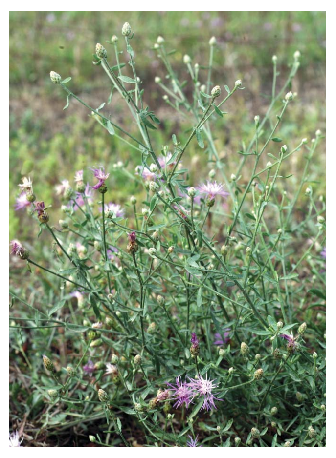
Knapweeds dominate large expanses of rangeland in the western Northern Great Plains.

Several other notable invasive species occupy thousands of hectares in the Northern Great Plains that are either widespread or habitat specific (e.g., riparian invasion). A few other common graminoid invaders include quackgrass ( Elymus repens [L.] Gould), johnsongrass ( Sorghum halepense [L.] Pers.), and reed canarygrass ( Phalaris arundinacea L.). Other broadleaf invaders include Canada thistle ( Cirsium arvense [L.] Scop.), absinth wormwood ( Artemisia absin thium L.), yellow and Dalmatian toadflax ( Linaria vulgaris Mill. and Linaria dalmatica [L.] Mill), sweetclover, and purple loosestrife ( Lythrum salicaria L.). Although the