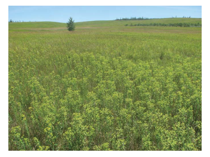
Leafy spurge has invaded rangelands throughout the Northern Great Plains.

plant species become displaced, and exotic grasses such as Kentucky bluegrass and smooth bromegrass often invade, creating a plant community that functions quite differently from the diverse, historic native plant community.<sup>21</sup>