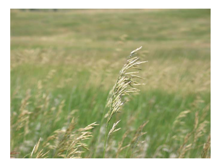
Smooth bromegrass is now a dominant component of many rangelands in the Northern Great Plains.

Similarly, cool-season perennial crested wheatgrass has been introduced into the western and northern portions of the Northern Great Plains to revegetate marginal croplands. Crested wheatgrass is a persistent invader in the west because