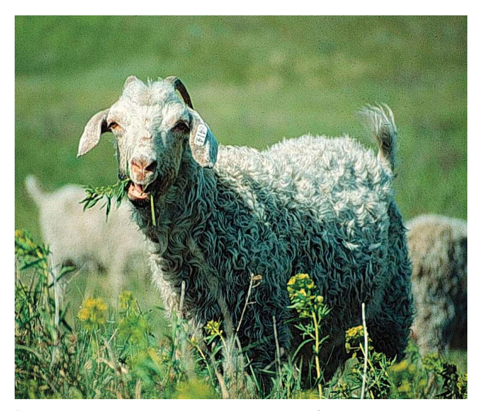
Both goats and sheep will readily utilize leafy spurge, which is as nutritious as alfalfa.

Numerous examples exist nationwide where invasive species are being utilized by livestock such as cattle, sheep, goats, as well as other alternative livestock. Sheep and goats are currently utilizing knapweeds, tansy ragwort ( Senecio jacobaea L.), Canada thistle, yellow star thistle ( Centaurea