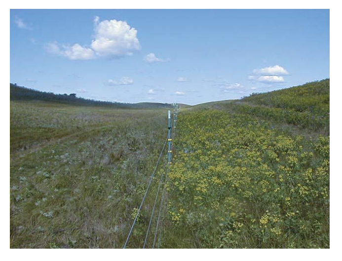
Fence line contrast of multispecies grazing impacts on leafy spurge and prairie health with cattle and sheep (left) and cattle only (right).

solstitialis L.), woody invaders, and many others, which can include some poisonous plants. Cattle are utilizing cheat-grass, Canada thistle, musk thistle ( Carduus nutans L.), as well as other forages usually not preferred within their diet. Finally, other breeds and classes of meat-producing livestock are currently foraging on invasive species worldwide that have not been considered in the United States yet.