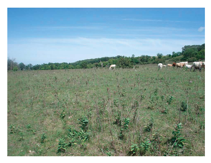
Overgrazing promotes Kentucky bluegrass in the Northern Great Plains along with several other invasive species.

Research controlling the spread and potential eradication of leafy spurge has been conducted since the 1930s. Herbicides have been the most popular tool for control of leafy spurge; however, they are often expensive and not cost effective.<sup>35</sup> Biological control of leafy spurge with insects has been suggested to be the most cost-effective and likely best long-term control method.<sup>36</sup> However, leafy spurge has been shown to be a nutritious forage species,<sup>37</sup> and grazing with