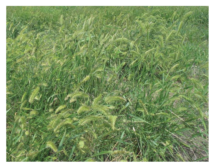
Crested wheatgrass is especially invasive in the western portions of the Northern Great Plains.