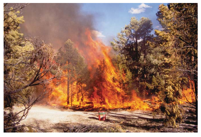
Use of prescribed fire in pinyon-juniper woodland.

The probability that a given shrubland will transition to woodlands, to nonnative annual grasses, or both is linked to three ecological concepts: ecological resistance, ecological resilience, and thresholds.<sup>20</sup> Ecological resistance is the degree to which a community maintains itself over time despite the introduction of invasive species. Ecological resilience describes the ability of a community to return to its predisturbance and, presumably, its pre-invasion state after a disturbance. Threshold crossings occur when a community does not return to the original state via natural processes following disturbance, but requires active management to restore the original state.<sup>21,22</sup> Research and management projects aimed at understanding the factors that influence ecosystem resistance to invasive species and resilience after fire and other types of disturbance are needed both to prioritize areas for restoration and other management activities, and to develop effective treatments for different types of ecosystems.<sup>20</sup> Defining the specific soil characteristics, vegetation composition, and abundance of different ecological types that are likely to result in recovery versus threshold crossings can be used to refine restoration and other management strategies. Further, increasing our