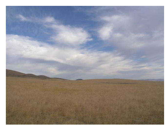
Sagebrush steppe converted to cheatgrass (Bromus tectorum).