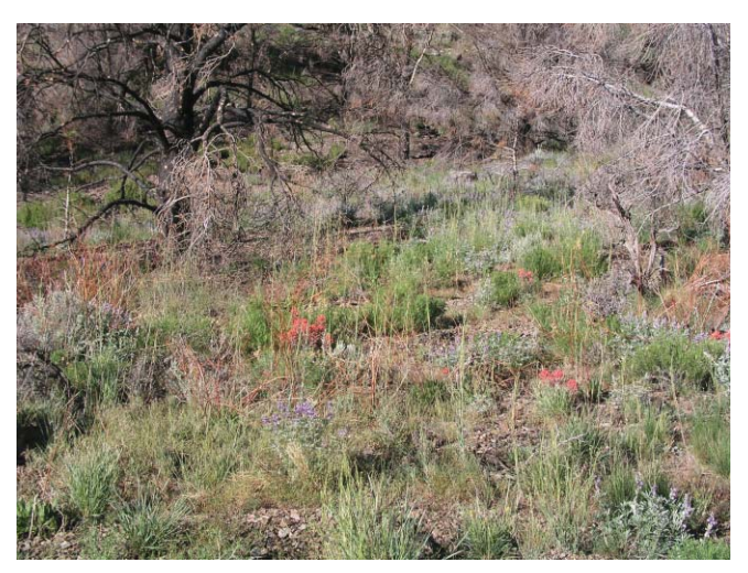
Recovery of sagebrush steppe following prescribed fire.

understanding of the effects of different management approaches, like biocontrol agents and prescribed or managed fire, is needed to effectively manage both wildfire and invasive species. For example, in pinyon-juniper ecosystems, it is necessary to identify methods for managing expansion that promote native recovery rather than conversion to an undesired state.