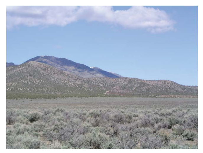
Sagebrush steppe and pinyon-juniper woodland.

fuel abundance and continuity. Consequently, fire frequency was higher in sagebrush types with greater productivity and during periods of increased precipitation.<sup>2,7</sup> More locally within sagebrush types, fire return intervals in sagebrush shrublands were likely determined by topographic and soil effects on productivity and fuels, and were also highly variable.<sup>8</sup> Salt-desert shrublands and desert scrub rarely if ever burned due to inherently low productivity and fuels loads.<sup>9</sup>