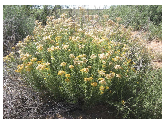
Rayless goldenrod

Toxicity occurs after consumption of 5–15% of the animal's body weight during a 1–3-week period. Like white snakeroot, tremetol is excreted in the milk, poisoning the