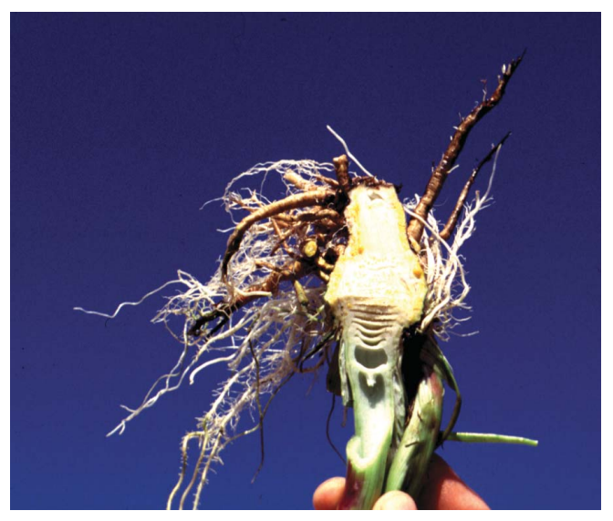
Water hemlock root

The toxins in water hemlock are long chain alcohols, concentrated in the oily, yellowish liquid that oozes from the lower stem or tuber when cut. Cicutoxin and cicutol are the main toxins that concentrate in the tubers. Early spring is usually the time when ingestion is most likely to occur. As the plant grows, the toxins decrease per unit of volume; thus more plant must be ingested for poisoning to occur.