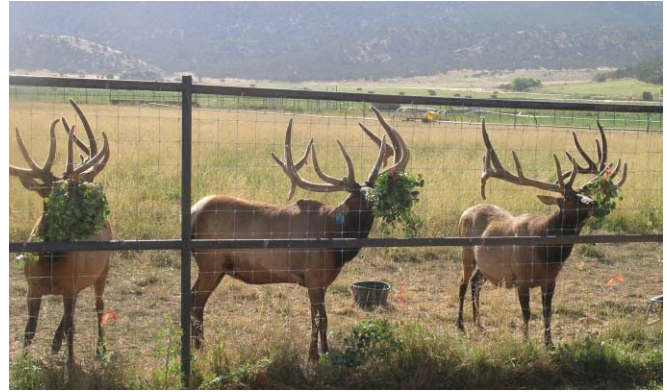
Figure 2. Each feeding trial was conducted similarly with five aspen clones and three bull elk. The aspen bundles were tied to the fence and the elk were allowed to feed. After feeding, all remaining aspen material was collected and returned to the lab for weighing. All trials were conducted at Kane Valley Elk Ranch in Ephraim, Utah.

For the five replicate feeding trials, we chose aspen clones that we knew (from previous work) had a range of defensive chemical concentrations. For 1 wk prior to the feeding trials, elk were acclimated to our presence and to feeding on aspen. In all the trials, we used the same three captive bull elk individuals (3 yr old). The animals were confined in a 5-acre pen at the Kane Valley Elk Ranch in Ephraim, Utah.