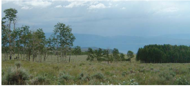
Figure 1. Aspen clones on Monroe Mountain, north of Koosharem, Utah. Note the differences between the clones in the left and center of the photograph compared with the clone in the lower right.

Variation in susceptibility to herbivory in aspen is not surprising, given that aspen are also highly variable in growth rate, physiology, disease resistance, and most famously, fall color. Although much less well-known, aspen chemical defenses also vary widely among clones 16 and likely influence mammalian herbivory. To date, very little work has been published examining the effects of aspen defensive chemistry on large mammalian herbivores, but the limited evidence suggests that aspen defensive chemicals are important determinants of elk herbivory. 12