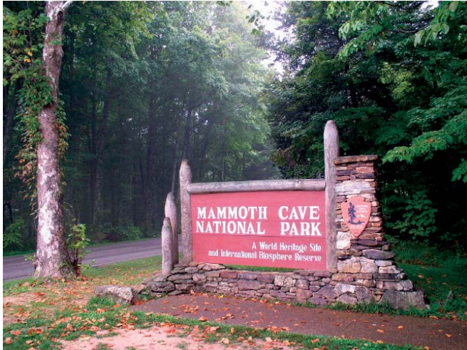
Mammoth Cave entrance.

opportunities for the skiing enthusiast. Whether you prefer daytime or nighttime skiing, this place has an option for everyone. For the prehistoric fanatic, a 10-minute drive can put you in the center of fossil heaven. Falls of the Ohio State Park, located on the river banks of the Ohio River just across from Louisville, is the home of one of the world's largest exposed fossil reefs from the Devonian Age. This wonder provides evidence that, more than 350 million years ago, an ocean once occupied the region that spreads from Louisville to Indianapolis.