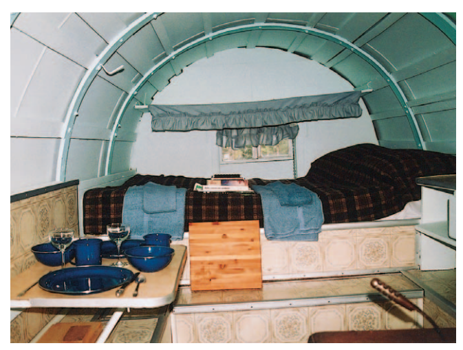
Inside the wagon, a wood-burning stove, small table and bed provide the basic essentials.

wagons all featured a bed, wood-burning stove, table, benches, cabinet, Dutch door, and a window in the back over the bed.