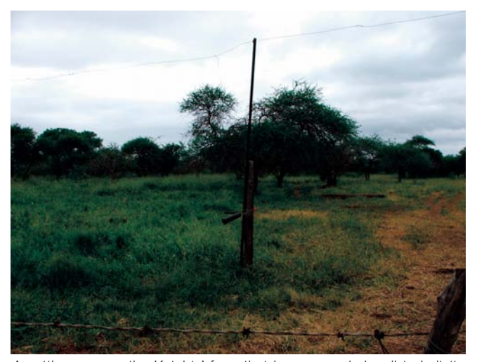
A cattle camp on the Knights' farm that has responded well to holistic grazing planning (left). The camp on the right was recently grazed.

dynamics were changed to produce the bush encroachment condition on the Knights' farm. The previous management decision of continual grazing with light animal impact resulted in a decrease in the community dynamics on the farm, and a few bush species were able to dominate.