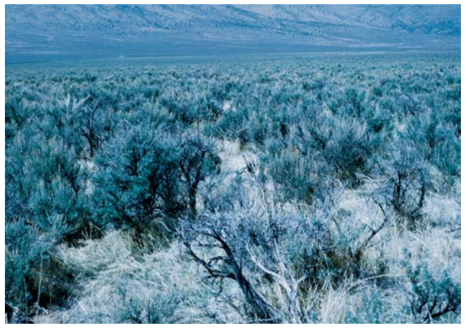
The exotic, highly invasive cheatgrass became established in the degraded big sagebrush communities and provided an early maturing, fine-textured fuel that increased the chance of ignition and rate of spread and extended the season of wildfires.

line may be greatly enhanced, but we continue where our experience lies with examples from the semiarid and arid environments of the far western United States.