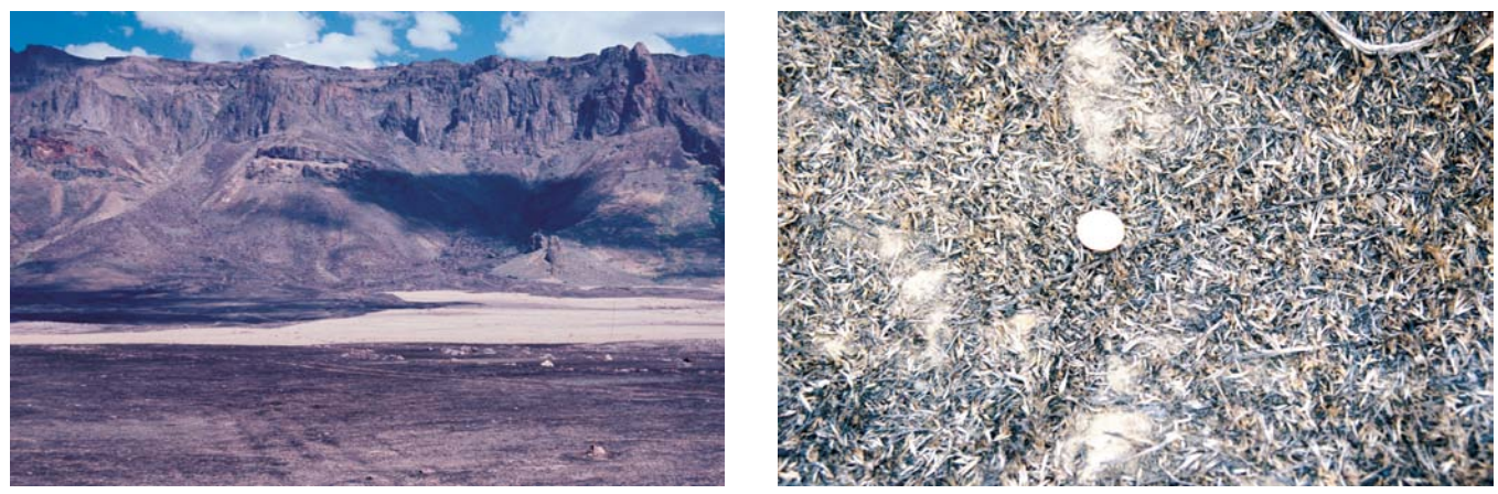
Left: Cheatgrass dominance truncated plant succession after wildfires and both ensured continued dominance and greatly reduced the interval between wildfires on the same site. Area near Midas, Nevada, burned in the 1999 wildfires that consumed over a million acres during a 10-day period. Note the unburned area on the alluvial fan that escaped the fire by chance distribution of roads. On the mountain escarpment in the middle of the image, a fire safe site is visible between 2 cliffs that probably still has native perennial grasses. Right: Seedbed of area of cheatgrass dominance burned in the 1999 wildfires in Nevada. The site had long been dominated by cheatgrass. The fast-moving wildfire did not even blacken most of the abundant cheatgrass seeds on the seedbed surface. Even the cheatgrass seeds with their awns singed will still germinate. Penny for scale.

In the case of weeds, "noxious" is a legal as well as a descriptive term. The legal connotation arises when a state or the federal government establishes lists of weed species and regulates these species by restricting their movement in commerce and requiring attempted eradication of the weeds from private and public lands. Normally, state noxious weed lists have a tiered structure with Category A weeds being the most serious pest that the state has either no infestations or very small and limited infestations for which complete eradication is being practiced. Category B weeds might be just as serious a pest, but infestations are sufficient in number and extent that eradication is difficult or impossible and complete containment and suppression is being attempted. If a Category C or greater noxious weed list is included in state regulations, the number and extent of infestations is greater than for A and B, but control is still being attempted. Depending on the state, these legal standards are backed by stiff fines and abatement proceedings where failure to control the weeds on private property can result in the state con-