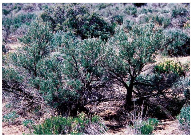
Excessive, improperly timed, and continuous grazing during the late 19th and early 20th century greatly reduced the native perennial grasses in the understory of big sagebrush communities. These degraded big sagebrush communities were virtually fireproof because of the lack of herbaceous vegetation to spread fires from shrub to shrub.