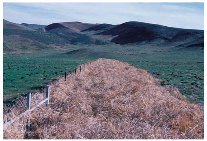
Russian thistle is another early succession species on rangelands. As indicated by mature plants collected on a fence, Russian thistle has an excellent seed dispersal system.

turbed communities. The important point is that they will have to be managed in rangelands in excellent condition.