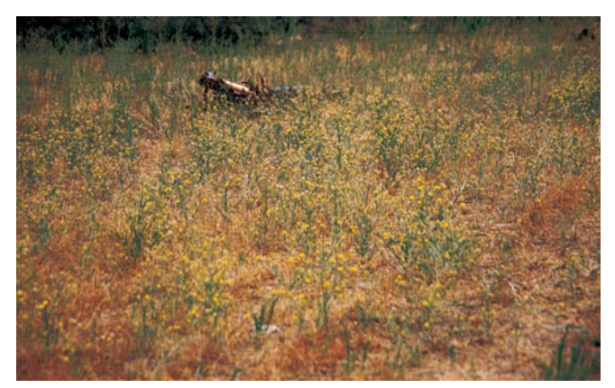
In this image, cheatgrass shares dominance with yellow starthistle and medusahead.

As previously mentioned, diffuse and spotted knapweed are nominal biennial weeds that can successfully invade bunchgrass ranges in high ecological condition. Nodding or musk thistle is primarily a species of meadow environments. Scotch thistle is another problem species in meadows, but it