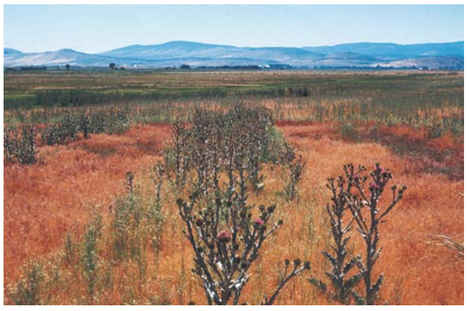
Biennial and perennial herbaceous weed species can replace or share dominance with cheatgrass. Scotch thistle in cheatgrass community located in Big Valley, Lassen County, California.

has the ecological amplitude to invade much drier sites. Bull thistle is one of the most common species in meadows in the sagebrush zone.