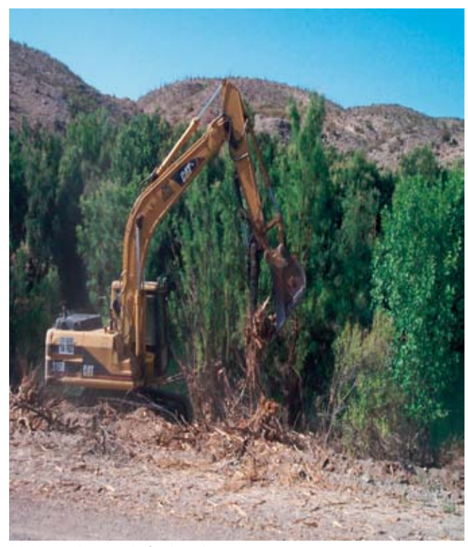
Mechanical removal of salt cedar.

Salt cedar does not support much wildlife but there are some wildlife species that are able to live in dense stands of salt cedar. Two species of birds are being protected. The 1st is the Southwestern Willow Flycatcher . This species of flycatcher is on the endangered species list. The other bird is