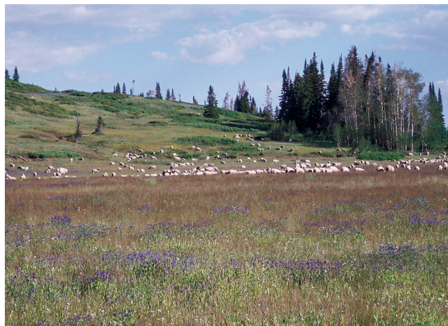
Figure 2. A recent picture of the Wasatch Plateau. Between 1880 and 1905, overgrazing by sheep and cattle was so pervasive that the "Wasatch Range, from Thistle to Salina, was a vast dust bed, grazed, trampled and burned to the upmost." 12 The situation was so bad that serious flooding, unheard of before, occurred in Ephraim Canyon and other canyons almost every other year.