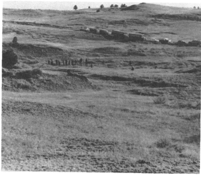
Vegetation and range site diversity make Makoshika Park an excellent place for a range contest.

Although the Commission was disbanded in 1979, this popular event has been continued by the SRM and volunteers from land management agencies, ranchers, universities, and private industry. More than 1,150 youth have participated during the 9 years. Their ages have generally ranged from 14 to 18 years.