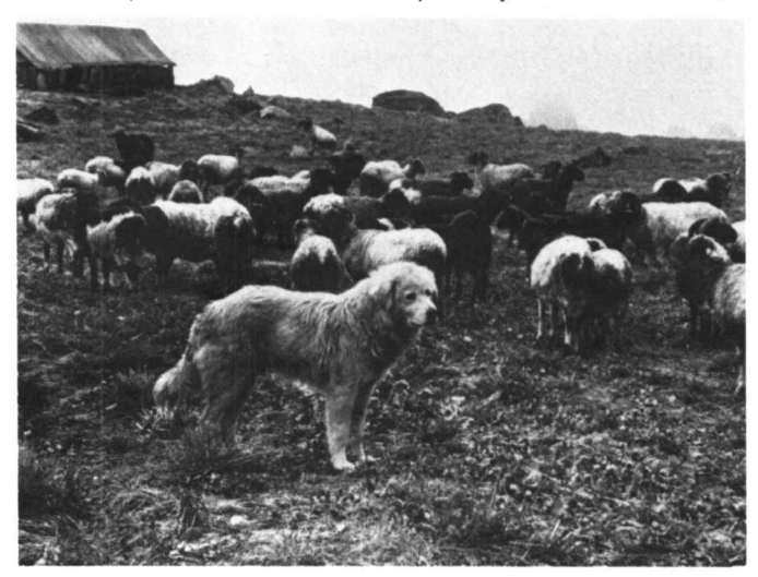
Tibetan Mastiffs have protected livestock on the Himalayan range for uncounted centuries against predators. This unique and handsome cream-colored mastiff stands watch over a herd of sheep in a high pasture in the Nepal Himalayas.

Tibetan Mastiffs have protected cattle, yaks, sheep and goats for uncounted centuries against formidable predators—wolves, leopards and bears, jackals, wild dogs and foxes and two-legged intruders, as well. Today, on the north American range, they are being used effectively against coyotes, too. They even have been observed driving off birds such as eagles and buzzards soaring overhead. In the Himalayas, mastiffs sometimes wear spiked collars and bells for protection. Tibetans especially like to adorn their