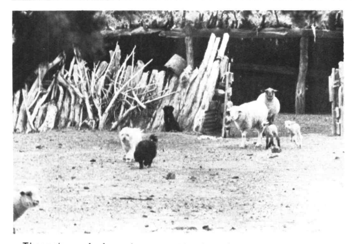
Three dogs of a four-dog group that have been with the same flock for nearly 5 years.

excavated depressions in the soil near the base of corral fences or within the corrals. They were fed once a day on table scraps or dog food, depending upon the attitude and economic status of the individual rancher. They were fed at the corral or called to the house for their meal. Those fed at the house returned to the corrals and flocks without commands.