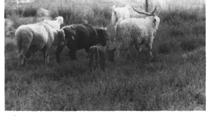
One of the five dogs that killed a coyote in July, 1980. This flock is seldom accompanied by a herder.

By invitation I was asked to visit a ranch near Inscription House, Arizona, operated by a middle-aged couple. I concentrated my activities on this ranch and several others in the general vicinity as opportunity and cooperative attitudes allowed. A typical 24-hour visit to a ranch consisted of my accompanying the herder for the evening and morning activities with the flock. I recorded the dialogue between the herder and me using a pocket-size tape recorder. Data