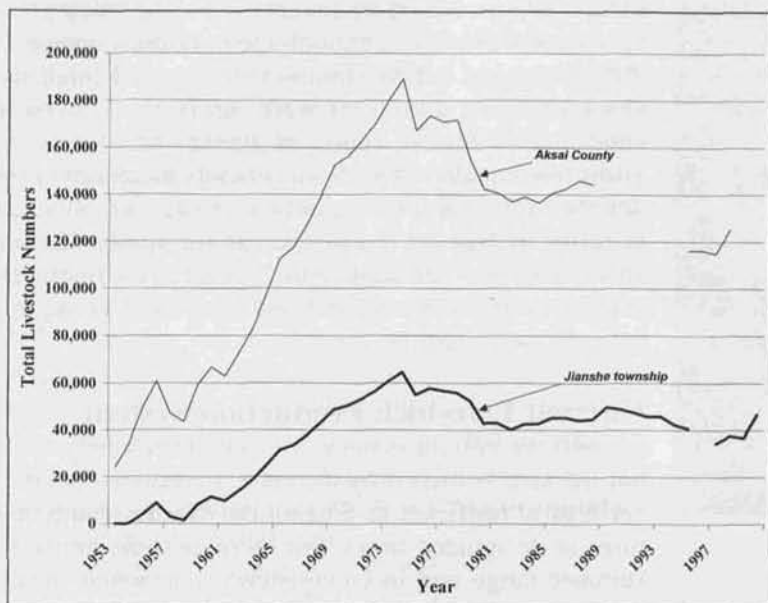
Figure 2. Trend of total livestock numbers in Aksai County and Jianshe Township, 1953–1999.

these wetland types are dominated by sedges and are much more productive than the surrounding vegetation.