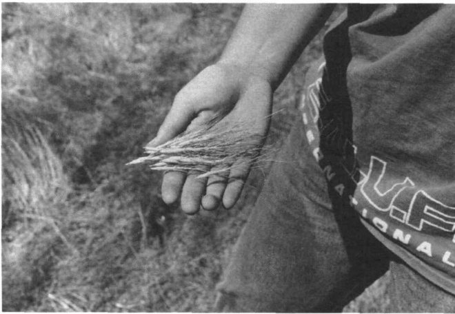
Fig. 2. Barb goatgrass ( Aegilops triuncialis L.) seedheads.

leaf area of barb goatgrass also develop rapidly (Table 1). Rapid growth, low palatability, and deeply penetrating roots give this weedy species a dominant place in many California plant communities.