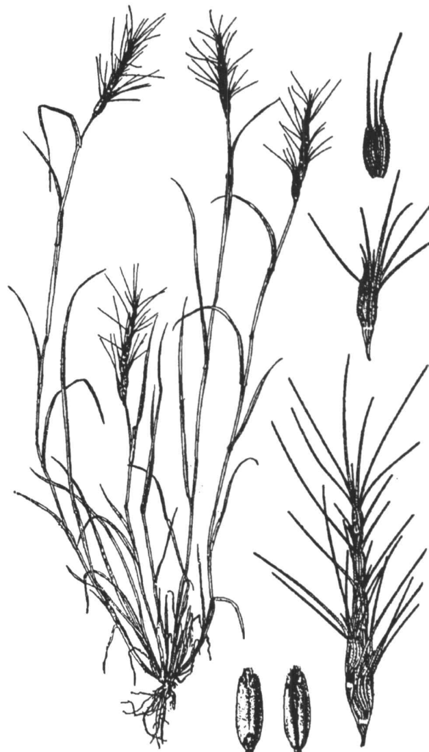
Fig. 1. Barb Goatgrass. Mature barb goatgrass plant with seed-head and seeds (from Kennedy 1928).

As shown in Table 1, barb goatgrass roots grow more rapidly and to a greater depth than soft chess, medusahead rye, and subterranean clover. Slender wild oats roots grow deeper but spread less. Barb goatgrass normally develops three roots from the seed, which quickly occupy a large soil volume. This adaptation probably enhances the plant's competitiveness and its ability to occupy a site. Shoots and