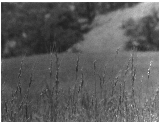
Fig. 4. California Annual Grassland with invading barb goatgrass on the Hopland Research and Extension Center, Hopland California.