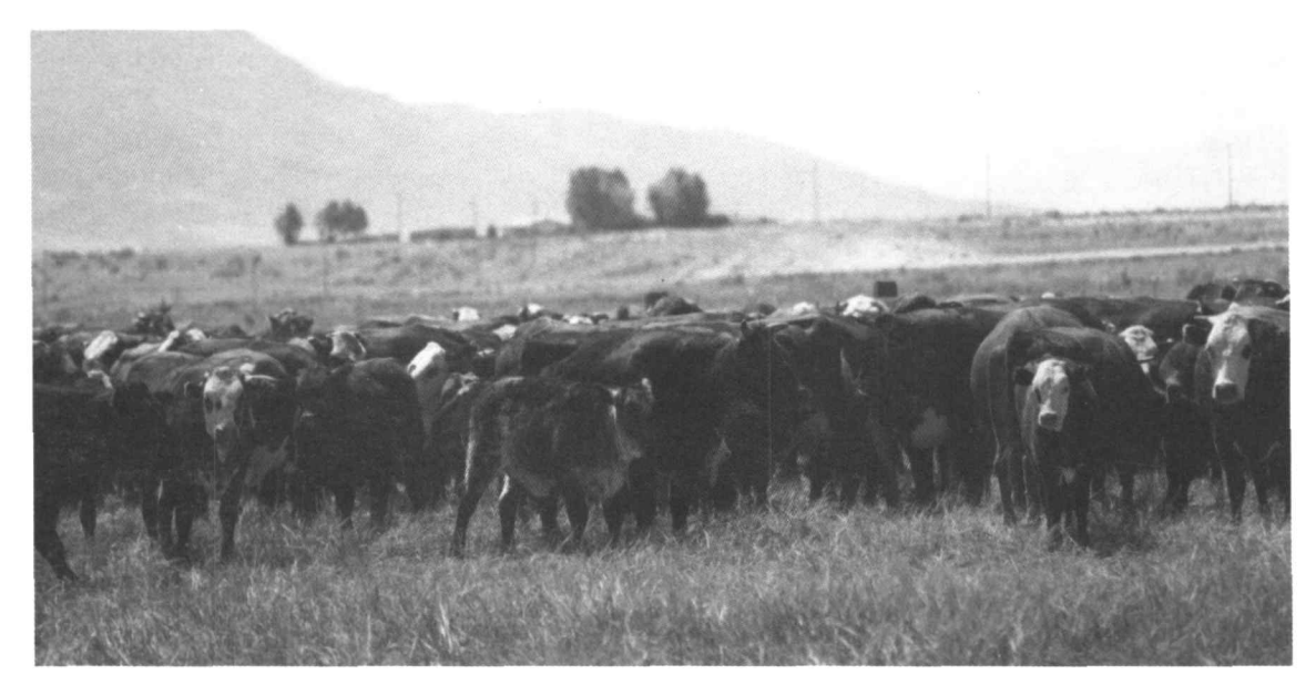
The T Quarter Circle cow herd on Humboldt River meadows during the mid-summer months. Taken by Nancy Tipton, 1991.

concern was to avoid debt, and especially never to mortgage the ranch. No matter what happened, the ranch could always provide a home and subsistance for the family. Apparently, family members listened well as the ranch has never been sold or mortgaged. Cattle were used as collateral if any loans were necessary. The concept of no mortgage may not be the most efficient use of capital for maximizing returns, but the safety factor can not be beat. This operation has been sufficiently profitable that borrowing against accrued value on the ranch was not necessary for continued operation.