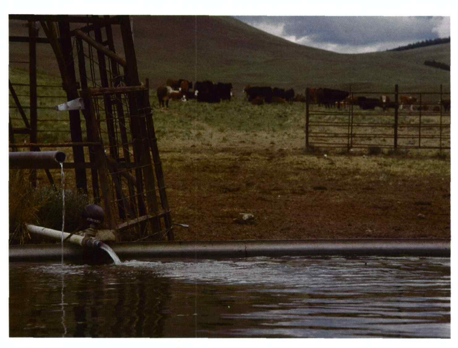
Grazing practices on Goose Gossage's ranch have made a field of dreams for conservationists.

grazing has been a major factor in the improvement of riparian condition. The amount of cover has doubled in the area compared to other nearby ranches in the drainage area.