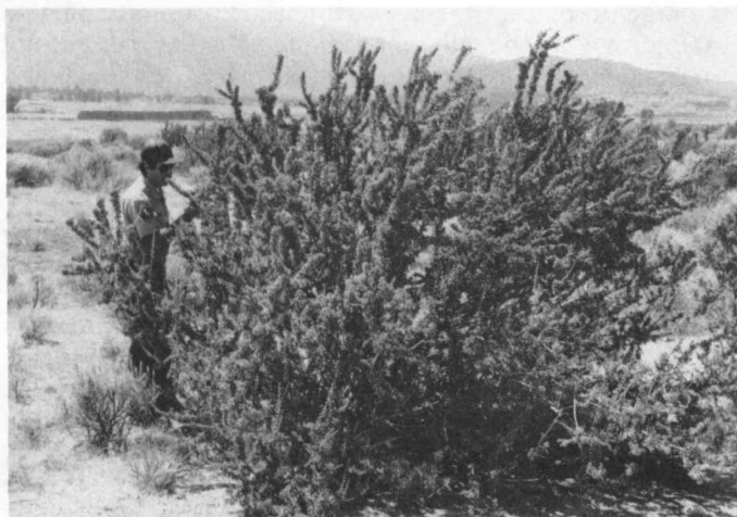
'Lassen' antelope bitterbrush growing near Johnstonville, Lassen County, California.

A unique selection of antelope bitterbrush ( Purshia tridentata [Pursh] DC) recently became the first accession of this valuable western shrub species to be released for commercial seed collection and production. Chosen for its productivity, palatability, winter leafiness, cover value, and seedling vigor, 'Lassen' antelope bitterbrush is a useful shrub for wildlife and livestock ranges, conservation plantings, and reclamation projects on adapted sites in the Intermountain and Pacific Northwest regions.