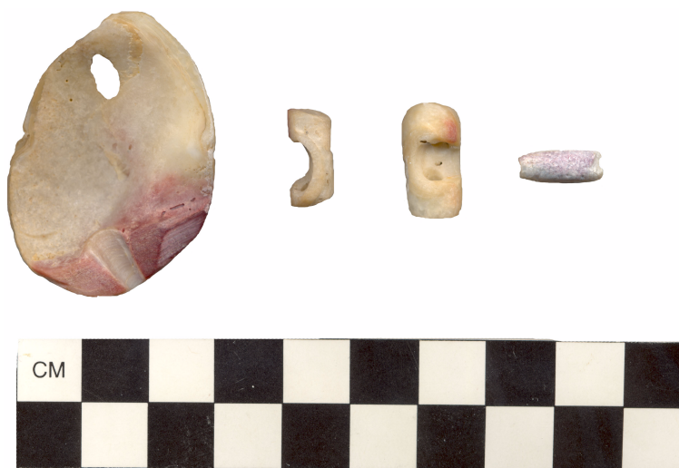
Figure 2 Giant rock scallop ornaments and beads from CA-SMI-608, CA-SMI-657 ( n = 2 ), and CA-SMI-162 (left to right).

dominated by large red abalone shells in a yellow-tan alluvial paleosol. Braje (2007) obtained ^{14}\text{C} samples from the midden exposures (Table 1) and excavated a 100-L bulk sample and a 2 \times 1 m test unit in the eastern gully wall of the northernmost locus.