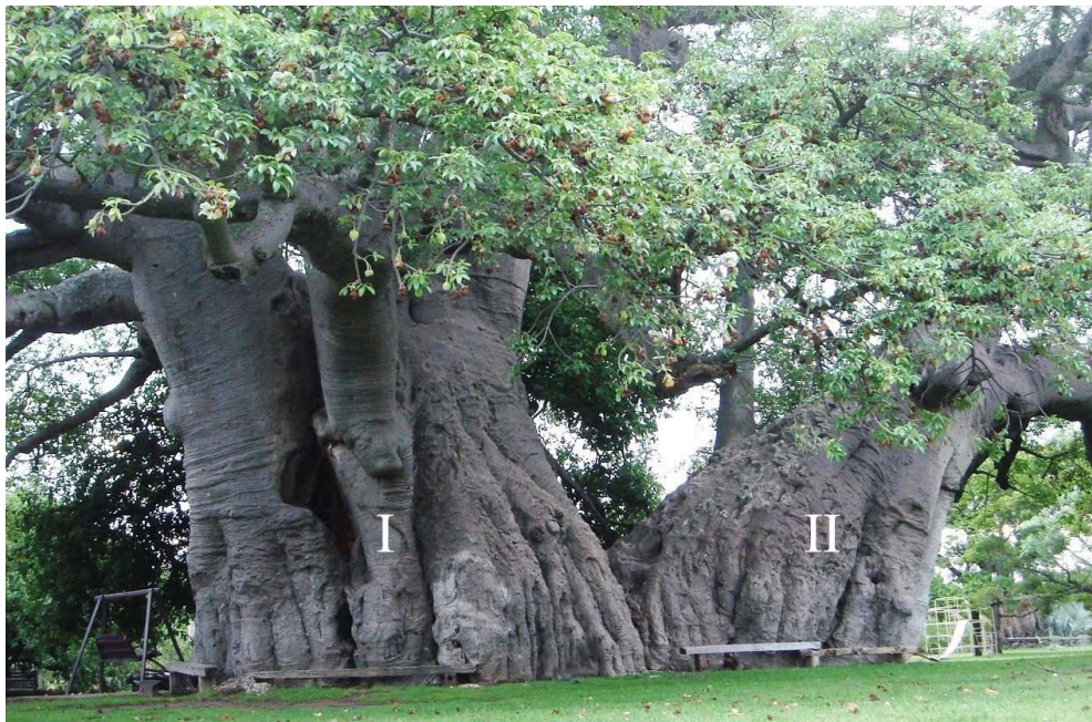
Figure 1 The impressive 2-stemmed trunk of the Platland tree, which is also called Sunland baobab

The tree has a height of 18.9 m and a total circumference at breast height (cbh; 1.30 m above ground level) of 34.00 m. Its footprint of 68.0 m 2 (which corresponds to a nominal diameter at ground level of 9.30 m) and the cross-sectional area at breast height of 65.3 m 2 are the largest known for an African baobab. The trunk consists of 2 stems (I and II), with a cbh of 24.13 m (stem I) and 18.33 m (stem II), see Figure 1. These stems are connected by a partially fused section, which has a maximum height of 2.01 m and covers a shared cbh of 4.10 m.