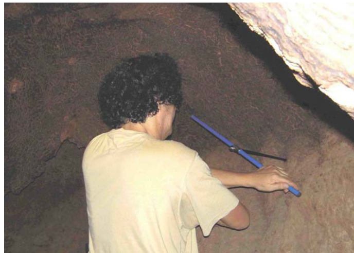
Figure 2 Collecting samples from the inner cavities

According to our new method of dating samples collected from open inner cavities, several wood samples were collected from different positions of the walls (samples 1, 2, 3, and 5) and ceiling (samples 4 and 6) of the 2 cavities of the Platland tree (see Figure 2). Samples from the lateral walls were obtained by using a Haglöf CO600 increment borer (60 cm long, 0.43 cm inner diameter). Twenty-cm-long samples were extracted from the ceiling of the cavities with a sharp cutting tool. The projections of sample positions on the cross-section of the trunk are shown in Figure 3.