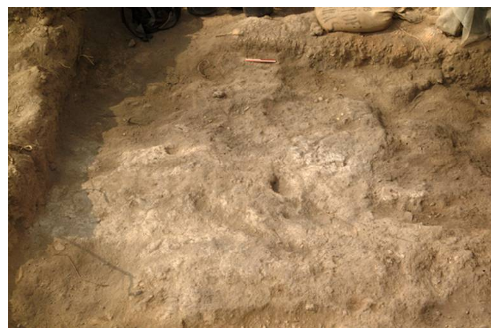
Figure 2 Photograph of a phytolith-rich layer about a centimeter thick from the Iron Age strata of Tel Dor, Israel. Scale bar is 20 cm.

The current state-of-the-art is that the materials that can be dated with confidence, namely bone collagen and charred materials, are the ones that often are not in the best contexts. The materials that are in good contexts and, in principle, can be dated, such as plaster/mortar, phytoliths, and organic residues in ceramics, cannot yet be dated with confidence. It is therefore a worthwhile challenge to solve these technical problems.