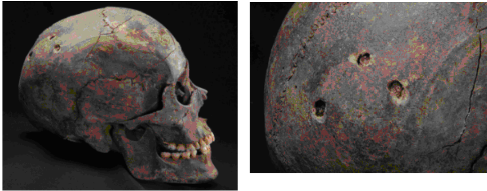
Figure 2 (A) Skull of the Longshan Giant (right-side view); (B) Close-up of the right parietal bone with drilled holes.

The skeleton was not found in an official grave; rather, it was buried in an irregular-shaped pit near the village during the Longshan cultural period (4400–4000 cal yr BP). When unearthed, the skeleton was found lying face down with both hands under the belly. No coffin, ornaments, or other burial objects were found in or around the skeletal remains. Figure 1 shows the original position of the skeleton as discovered in the field. When we removed the dirt from the skull in the field, we noted 3 holes of 5 cm in diameter drilled into the right parietal bone (Figure 2).