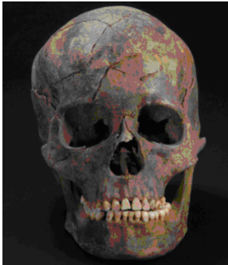
Figure 3 Skull of the Longshan Giant (frontal view)

skull, did he die in a tribal war or due to an accident occurring during brain surgery? While trepanation was common in European and Central American Neolithic societies, the practice was unusual in Asia.