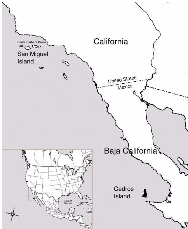
Figure 2 Location of Cedros Island, Baja California (Mexico) and the southern California coast (USA) from which originate the \Delta R values discussed in this paper. Inset: location of portion of Baja California (Mexico) and California (USA) in relation to North America.