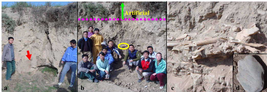
Figure 2 a) The original cliff where a small piece of bone (arrow point) was discovered during a student excursion; b) the students on the field trip. After the cliff was cleaned, large amounts of fossil bones and teeth, ceramics, and artifacts were found (circled area). The dotted line marks the boundary between upper artificial material and the lower original loess-paleosol sequence; c) the fossil bones and teeth of sheep and horses; d) artifact (stone tool) used to smash the bones for marrow.