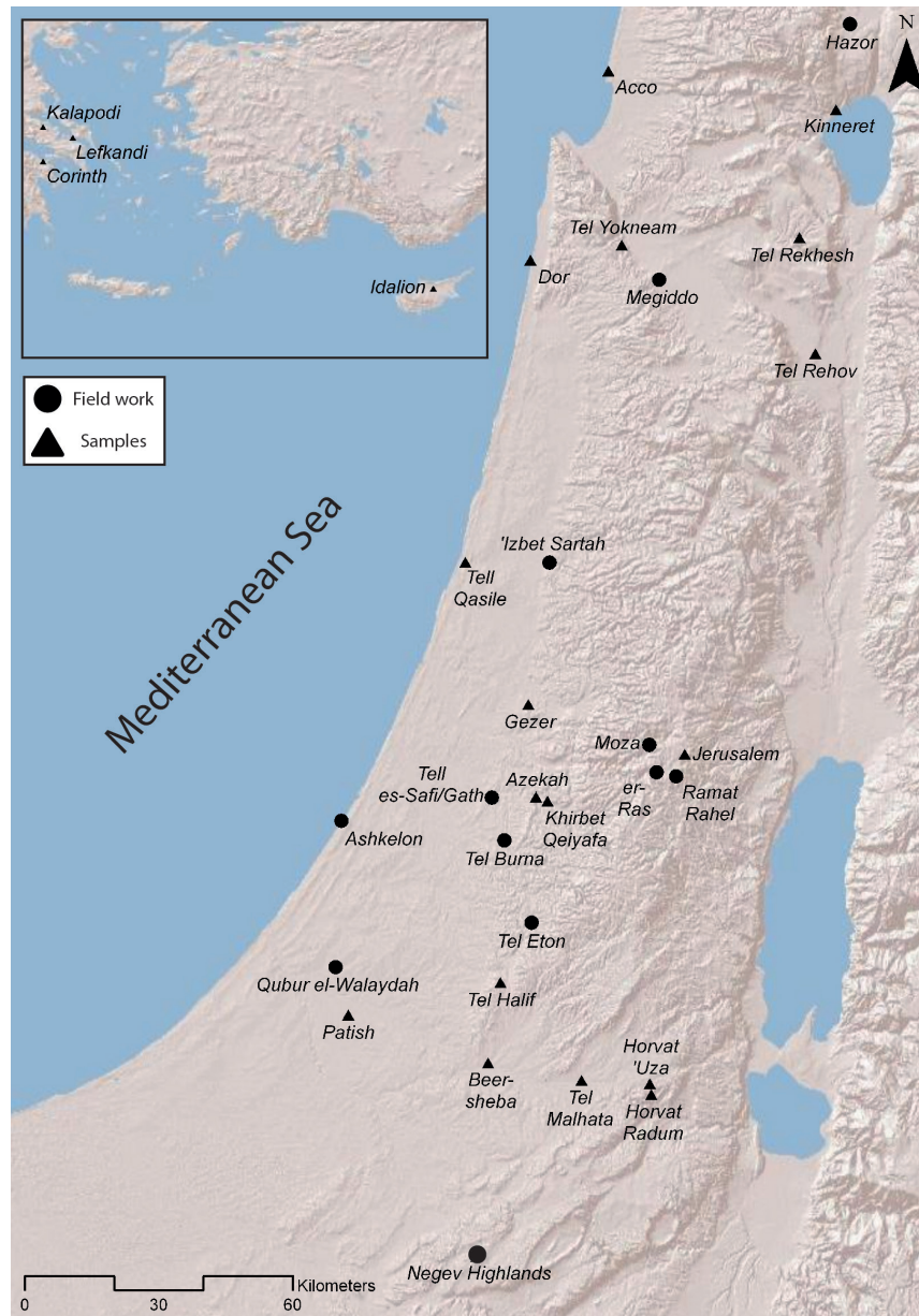
Figure 3 Reconstructing Ancient Israel project: sites where actual fieldwork was carried out and sites sampled.