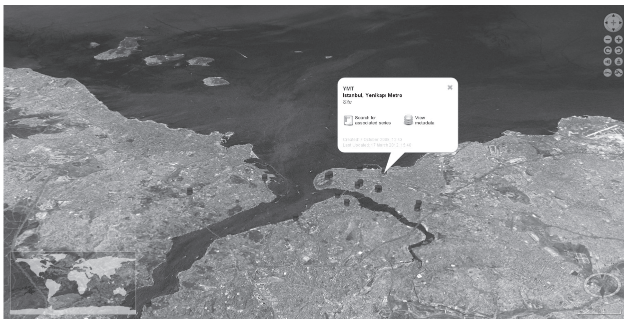
Figure 2. Screenshot of the 3D mapping interface in Tellervo. The map shows a view south of the archaeological sites in Istanbul within this Tellervo database, overlaid on LandSat imagery of the city. Note the exaggerated topography, the map markers for sites sampled in and around the city, as well as the highlighted location of the Yenikapı excavation. The popup tag gives the user direct access to the metadata describing the site, as well as the ability to quickly access all associated data series.

The 3D map viewer capabilities within Tellervo are not intended as a fully fledged geographical information system. However, for users who would like to perform spatial analysis of their data, this can be done by connecting to the PostGIS-enabled Tellervo database from standard GIS software. One example of how this was used during the Yenikapı project is included in the publication by Pearson et al. (2012). They used the spatial data within Tellervo to explore phases of use and repair, in this case by plotting the location of samples within a specific dock. Although four phases