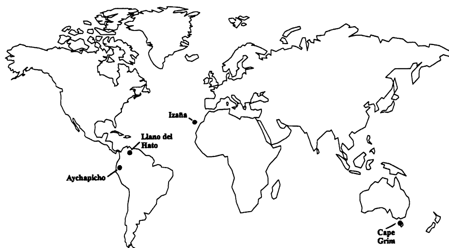
Fig. 1. Map showing the location of four stations monitoring the atmospheric ^{14}\text{CO}_2 level