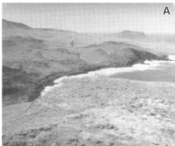
Fig. 3A. View eastward across Bahia Braithwaite from the trachyte dome just west of the "trap door" structure in Fig. 2. Arrow indicates "saddle area" between scoria cones, where dated samples were collected.