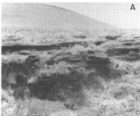
Fig. 4A. View looking southwest from creek bounding the study area on the east. Outcrop in foreground exposes well-stratified lacustrine sandstones (Q1, arrow) underlain by a cinder deposit containing coarse lapilli of fine-grained, vesicular basalt, which makes up the base of the southernmost cone (hill in background). Note the northward-dipping, low-angle cross-stratification of the lower beds of the sandstone sequence, which thicken toward the saddle area between the two cones.