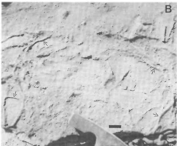
Fig. 4B. Bedding plane exposure of lower part of lacustrine sequence (Q1) at the location of the arrow shown in Fig. 3B. The bedding plane surface is covered by a dense, branching network of horizontal root casts (rhizoliths) and permineralized wood. Scale bar is 2.0 cm.

and into the stream valleys that incise the saddle area from the east and west. The eastern lobe of the flow evidently moved beyond the lateral extent of the lacustrine sequence and far enough downslope so that, in places, the distal edges actually lie at a lower elevation than the stratigraphically older lacustrine sequence. This relation is most visible in the southerly flowing stream that bounds the area to the east. At that location, erosion has stripped back the edge of the younger flow, exposing its basal contact, an irregular unconformable surface lying just above the weathered surface of the older alkalic basalts of the Lomas Coloradas Formation.