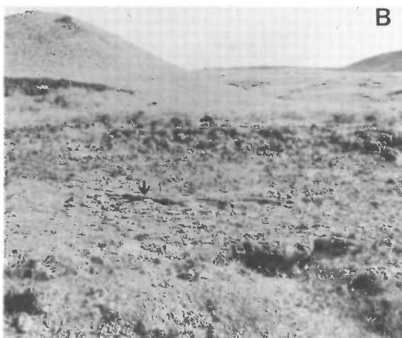
Fig. 3B. View looking northeast from within the saddle area indicated by arrow in Fig. 3A. Rock hammer to right of arrow in center of photo rests upon lacustrine sandstones (Ql) near position of oldest dated horizon (Sample 1, UCLA-2618, Fig. 2). The lacustrine deposit is overlain locally by a black vesicular basalt, Qvb, (upper left at base of cone), the stratigraphically youngest unit in the map area. This flow issued from fissures near the base of the northern cone, and flowed downslope, entering the upper part of the stream drainages that breached the cones from the east and west.

Retallack (1988) points out that fossil root traces are best preserved in formerly waterlogged sedimentary profiles. The location of the deposit in the low area between the scoria cones, the well-sorted nature of the sediment, absence of marine indicators and abundance of plant fossils, suggest deposition in a terrestrial aquatic (lacustrine) or perhaps paludal (swampy) environment, similar to the ephemeral lakes that are found within the craters of some cinder cones on the west side of Socorro Island (e.g., Lago Luna, Fig. 3 of Bryan 1959). The lacustrine units exhibit a broadly lenticular geometry and low-angle cross-bedding that dips gently to the north, toward the saddle area (Fig. 4A). The extensively developed, in-situ root networks, fine-grained and well-sorted texture of the sediments and abundance of organic material argue strongly against a pyroclastic surge origin for the sampled units.