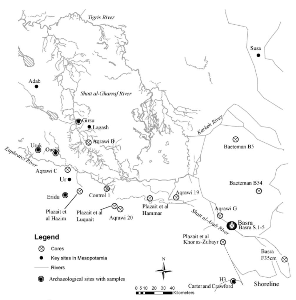
Figure 3 Dated <sup>14</sup>C sample locations in southern Iraq and Khuzistan