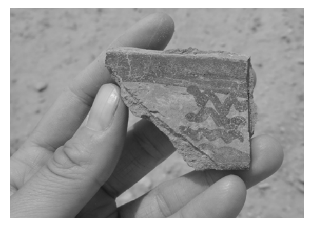
Figure 2 'Ubaid 2/3 pottery sherd at Sample EP-3 collection point.