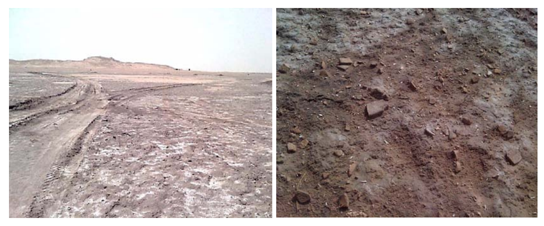
Figure 4 Eridu. (Left) Vehicle tracks to the high mound. Note the ruts—this area is often inundated with sheetwater following rains. Note also the gypsiferous evaporates visible as white surface salts, and the near-absence of surface shell. Arrows indicate sample collection points. (Right) Collection point for sample EP-4, 2–3 m above the floodplain. Note the dense admixture of shell, pottery sherds, and brick fragments, typical of denuded mudbrick. Note also the absence of any crusted silt, plant fragments, or reed casts that would be consistent with recent inundation.