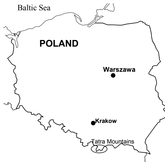
Figure 1 Map of Poland with the location of Kraków