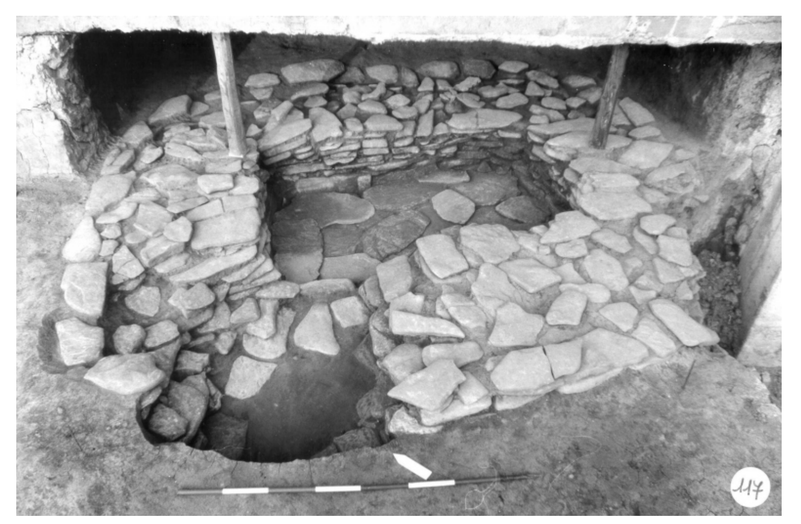
Figure 2 The monumental structure discovered at the Papillon site. The damage caused by previous access through the southwest corner is clearly visible.