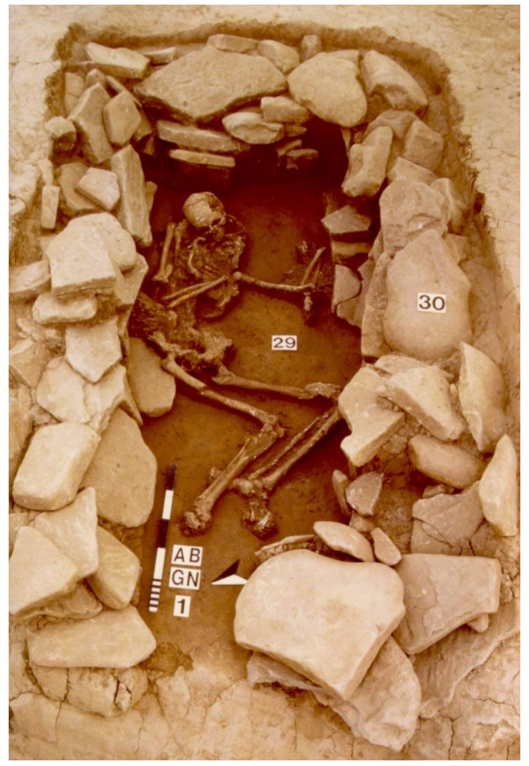
Figure 3 The skeleton discovered at the Le Ginestre site. For additional information see the text.