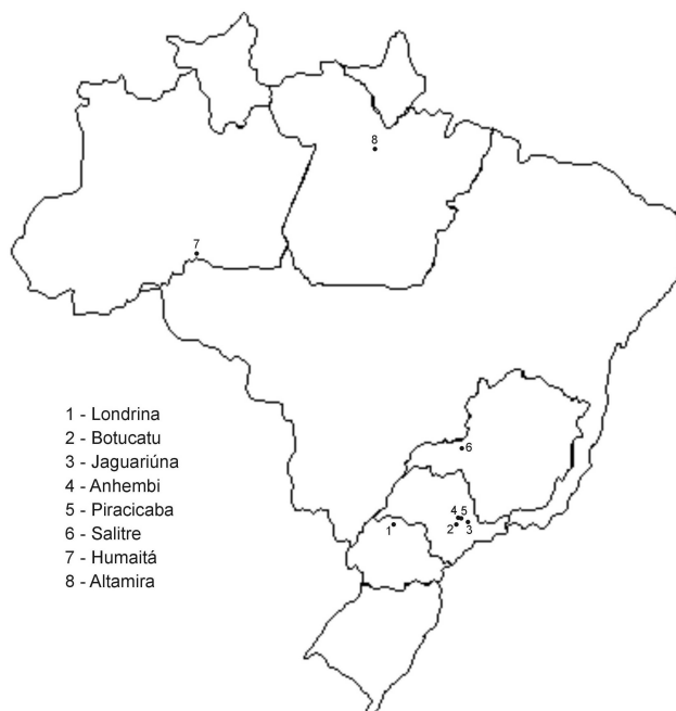
Figure 1 Map of Brazil showing the study sites