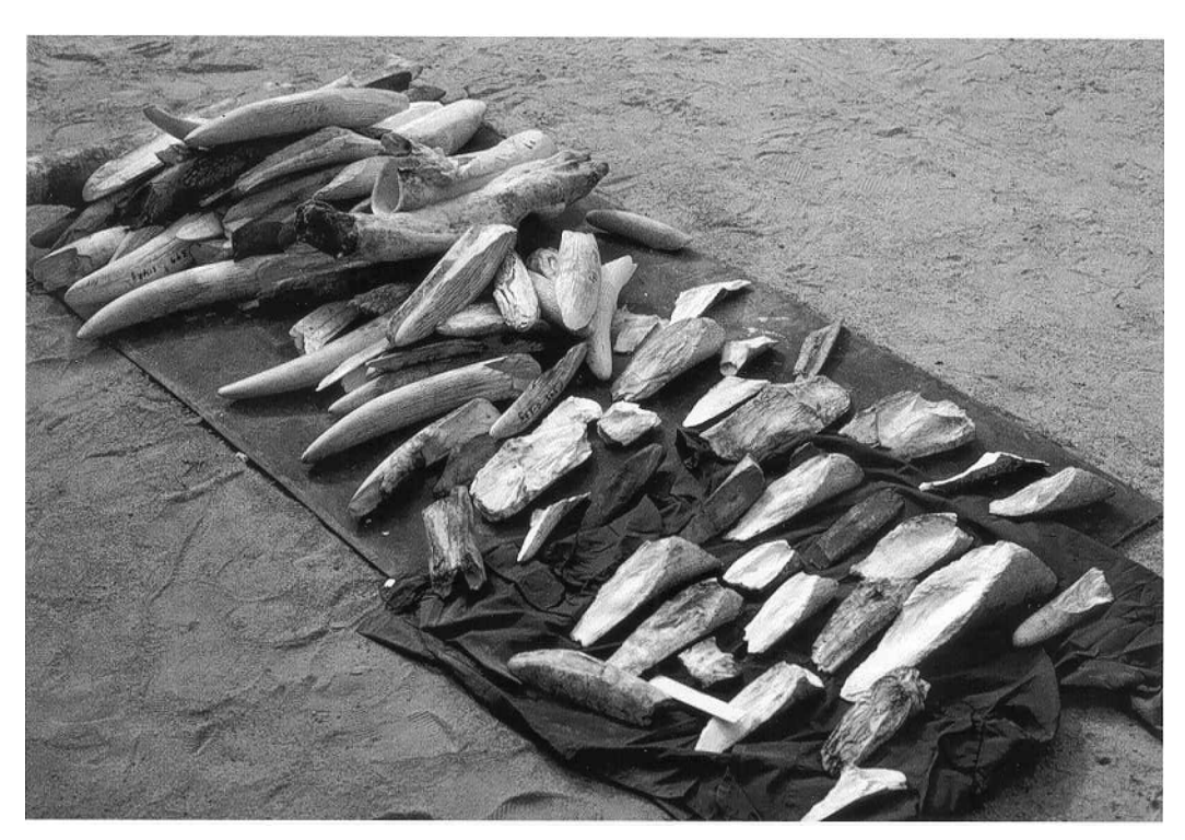
Figure 3 Tusk fragments collected from water sources in Hwange National Park. All were fractured by elephants using their tusks to shove each other away from water. Many specimens display features identical to percussion-flaked stone cores and flakes, such as bulbs, ripple marks, and hackle lines.