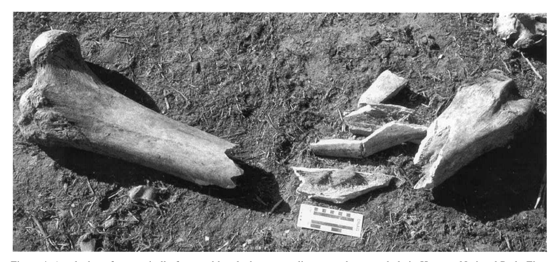
Figure 4 An elephant femur spirally fractured by elephant-trampling around a water hole in Hwange National Park, Zimbabwe. The DNAG scale bar is marked in inches at the bottom and centimeters at the top.