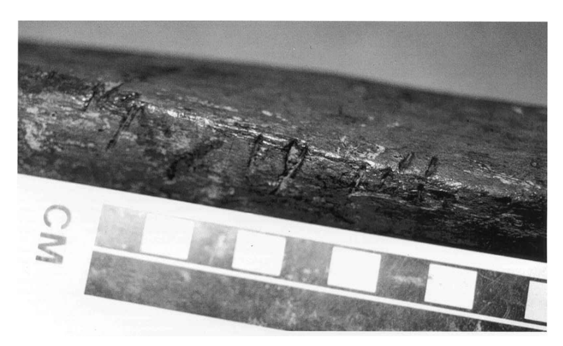
Figure 1 A bone from the Mud Lake mammoth, Wisconsin USA. These sorts of marks have been interpreted as cuts or chops made during butchering by humans (Overstreet et al. 1993).

bones and the sediments are deformed, sometimes severely. Subsurface probing, repeated surface scraping by heavy equipment, and repeated sediment block movements would bend, deform, and fracture bones embedded in the sediment. Bones and tusks bent too far will break apart in chunks, flakes, and spalls (Figure 2), some of which may appear to be percussion-flaked, because they possess features such as one thick end (appearing to be a striking platform) and one thin end (feather termination), hackle lines on ventral surfaces, ripple marks, and ring-cracking or depression fracturing where solid pressure was applied, either directly, such as when parts of the equipment contacted the bone surfaces, or indirectly, such as when the force of the equipment was applied through intermediate bodies such as other bones, pebbles, fragments of bones, or other clasts in the sediment.