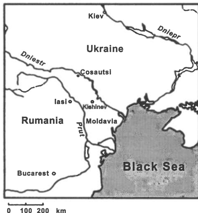
Fig. 1. Location of the Cosautsi site

were taken out of sections or out of small benches, allowing a continuous control of the stratigraphy and avoiding distortions caused by, e.g. , krotovinas or cryoturbations.