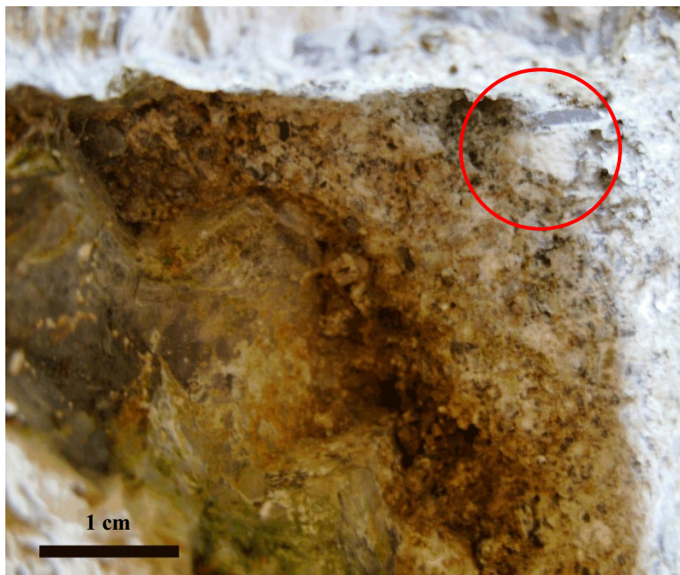
Figure 1 Mortar joint with lump of lime (upper right corner, circled)

Historical sources show that during old building projects, clods of calcium oxide, taken out from the kiln after limestone burning, were immersed in a pool where the moisturizing of oxide and its dissolution to calcium hydroxide was carried out. This process was made easier by a continuous, manual mixing done with characteristic tools. This process was aimed to the complete dissolution of the clods and to the production of “lime putty,” which was then mixed with sand and aggregates to produce the mortar. During this process, some small lumps of calcium hydroxide could remain compact while being mixed with the sand into the mortar. These lumps, with their characteristic hardness and white color, are clearly distinguishable inside mortars or plasters (Figure 1), from the sand grains. During the hardening of mortar, atmospheric \text{CO}_2 is fixed in the lump to form calcium carbonate in the same manner as the mortar matrix. These samples are thus also suitable for ^{14}\text{C} dating, but are much less sensitive to contamination than the mortar since they can be easily distinguished from the mortar matrix and from the aggregates.